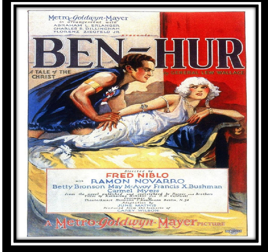
Featuring live organ accompaniment with