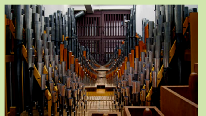
The Longwood Organ will be re-inaugurated on February 4 and 5, 2011, after the second complete rebuilding in its 82-year history. Join us for this landmark occasion!

<u>Find out more about the Longwood Organ, and listen to the sounds of the pipes!</u>