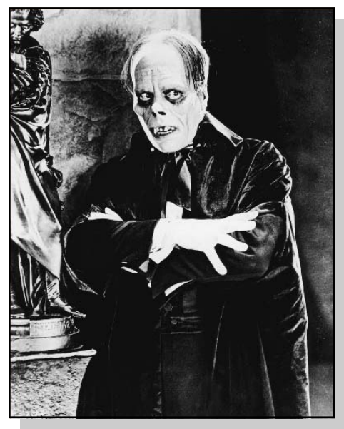
WILL YOU BE READY WHEN THE CRUNCH COMES ON JUNE 9? (SEE PAGE 3...)

June 9 - 7:30PM Capitol Theatre York Open Console highlighting those members who "scored" their short silent film based on the April workshop. Open console follows. All may attend.